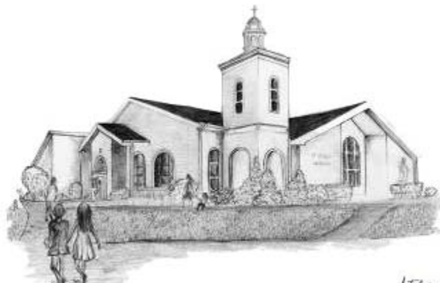
St. Rosalie's in Hampton Bays