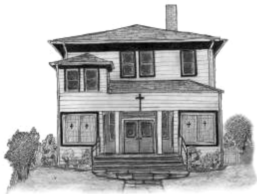
St. Rosalie's in East Quogue