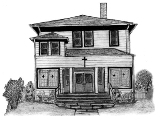
St. Rosalie's in East Quogue A. Longfellow